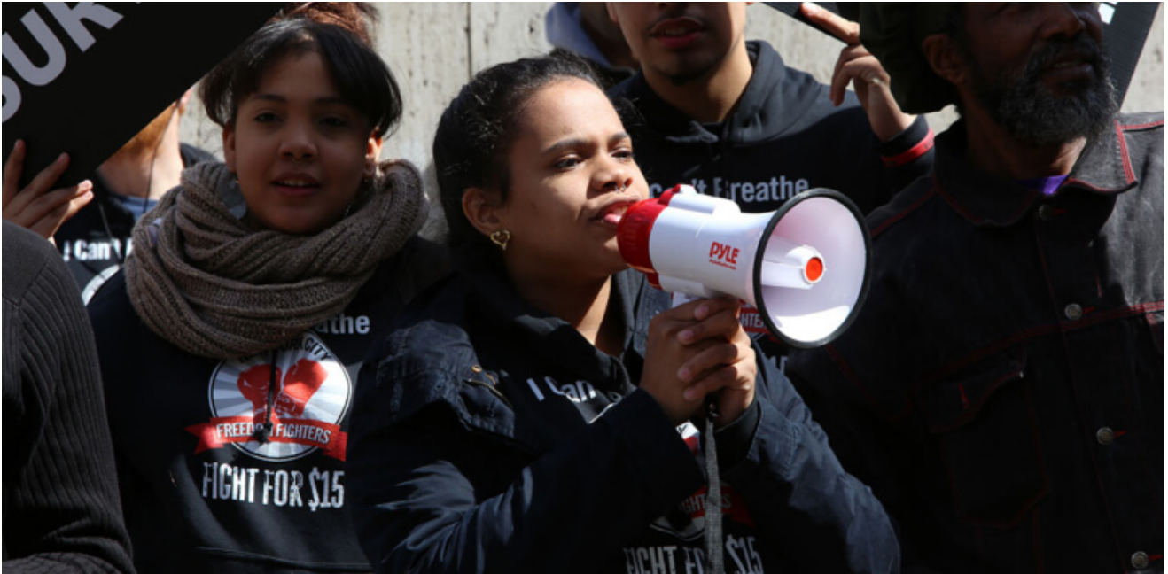
High school students, union activists, and fast food workers rallying in New York City to demand a $15/hour federal minimum wage, April 2015.