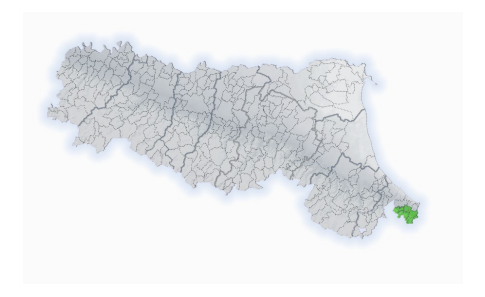
Figure: Emilia Romagna municipalities - 2001

• Only one MU, including 9 municipalities and serving 20,767 inhabitants, around 1% of the regional population.