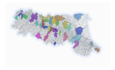
Figure: Emilia Romagna municipalities - 2011

• 31 MU, over 160 municipalities and 1.5 million of inhabitants, that is 34% of the total population of Emilia Romagna.